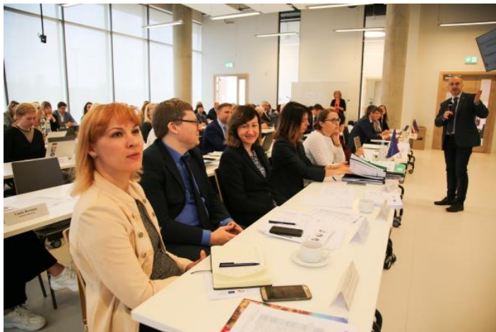
The presentation of the deputy state secretary Mr Armands Eberhards, 29/05/2019