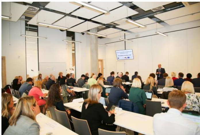
The last MC meeting in Riga, 29/05/2019